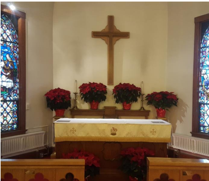
Our Altar during the Christmas season