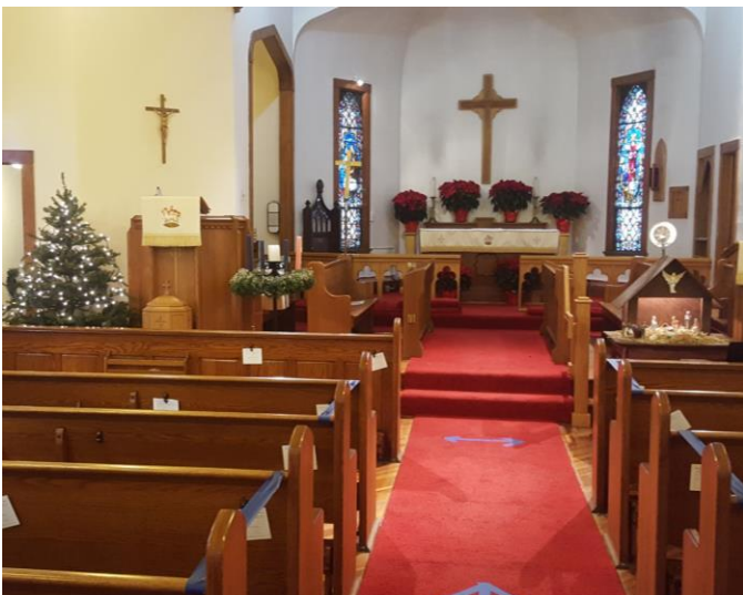
Our Sanctuary during the Christmas season