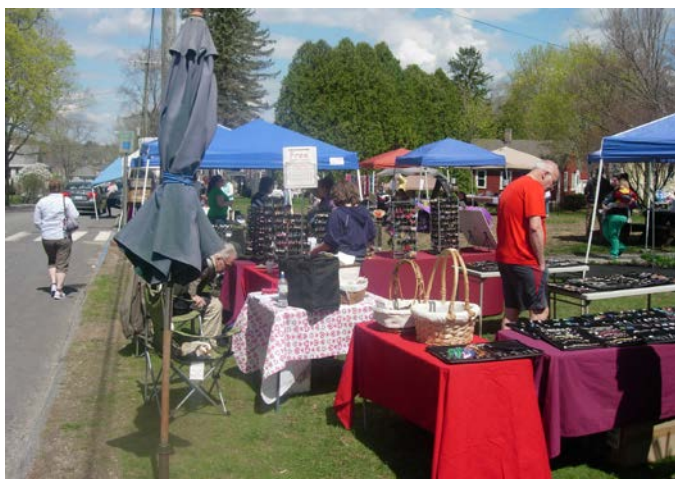
Last year vendors lined Babcock Avenue on the church lawn