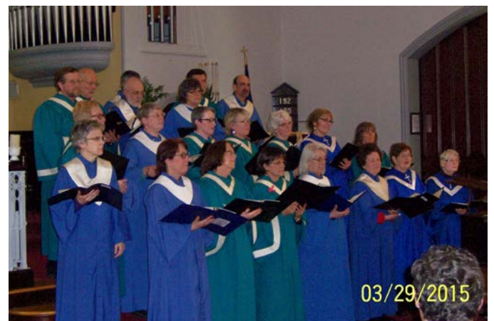
Members of the all the choirs perform during the 86th Annual Palm Sunday Concert of Sacred Music