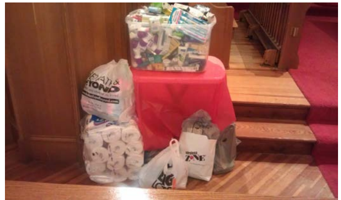
Some of the donated Toiletries

and other local food pantries and shelters. Items that were donated included toothbrushes, toothpaste, soap, shampoo, wipes, chapstick, skin lotion, nail clippers, brushes, combs, nail file, bandaids, Q tips, sewing kits, Kleenex, toilet paper, feminine products, disposable razors, shaving cream. Travel sizes and small packages are preferred however all donations are welcome. Our collection ended Palm Sunday, March 29th . Thanks to all who during Lent collected toiletry supplies. Because of your support the drive has been very successful! Again thanks, thanks, thanks.