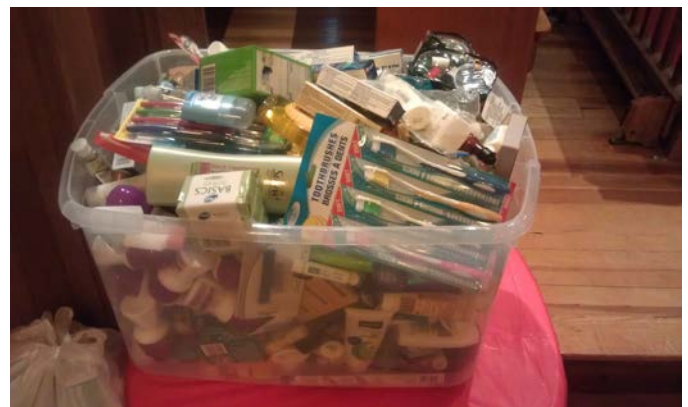
A bin full of toiletries