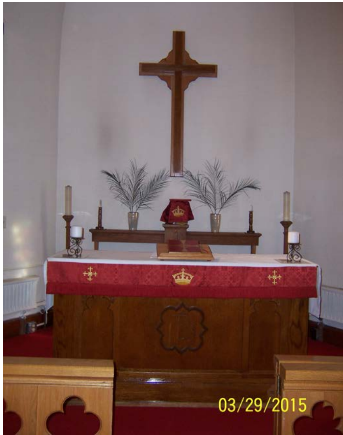
Our Altar area for the celebration of Palm Sunday

the reading of a Psalm, we made our way into church with the Guitar Choir leading us in singing "The King of Glory" to continue our worship service to celebrate Jesus' triumphant entrance into Jerusalem.