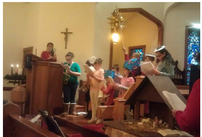
"And a star shall guide the wise men"