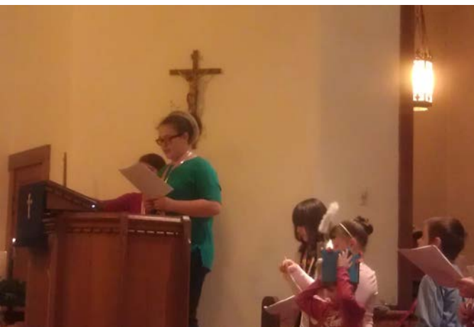
Another young adult narrating a part of the pageant