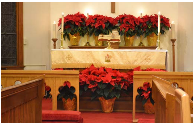
Our Altar on Christmas Eve

This year's 7:30 p.m. Christmas Eve Service was attended by almost seventy people and featured a variety of Christmas music performed by our Guitar Choir and from our electronic organ. The Guitar Choir led us in "Angels we have heard on high", "It Came Upon a Midnight Clear", "O Holy Night", "Mary's Boy Child", "Silent Night" and "Hark the Herald Angels Sing".