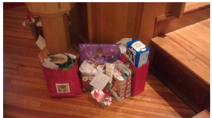
Some of the gifts for the Domestic Violence Shelter

Gifts were returned by the fourth Sunday in Advent, December 21st, and placed unwrapped with the name tag under the tree. Many thanks to all who took name tags to brighten a Christmas for people in need.