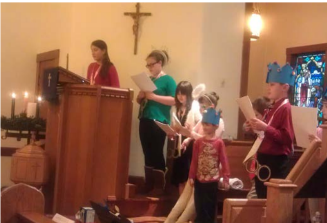
Bree narrates part of the pageant