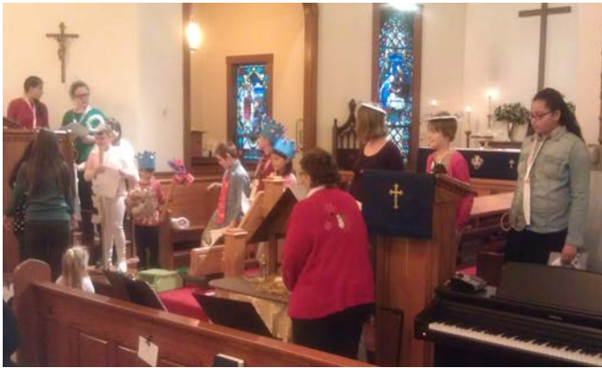
Our Sunday School Teachers get everyone in position