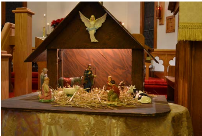
St Paul's Crèche before the start of Christmas Eve service

Our Christmas celebration continued on Christmas morning with a celebration of the Holy Eucharist at 9:30 a.m. The celebration continued on Sunday, December 28th with a