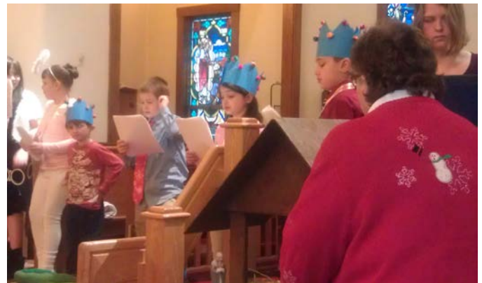
The younger students reading their parts