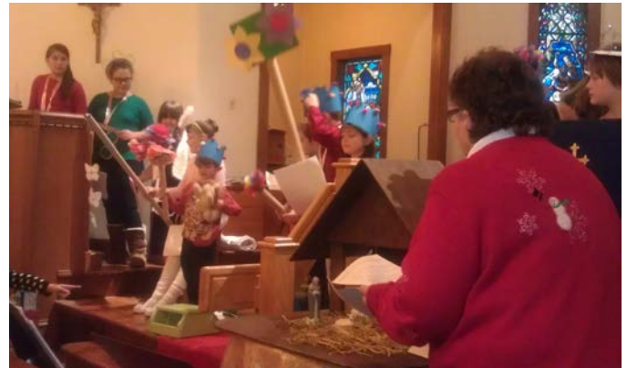
The younger students with their props