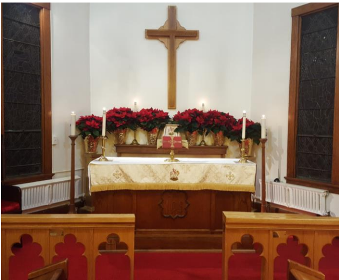
Our Altar during the Christmas season

This year's 7:30 p.m. Christmas Eve Service featured a variety of Christmas music performed by our Guitar Choir and from our electronic organ. The Guitar Choir led us in "Angels we have heard on high", "O Holy Night", "Go tell it on the mountain", "Silent Night" and "Hark the Herald Angels Sing" as well as performing a Christmas "Hallelujah" as an anthem during Communion.