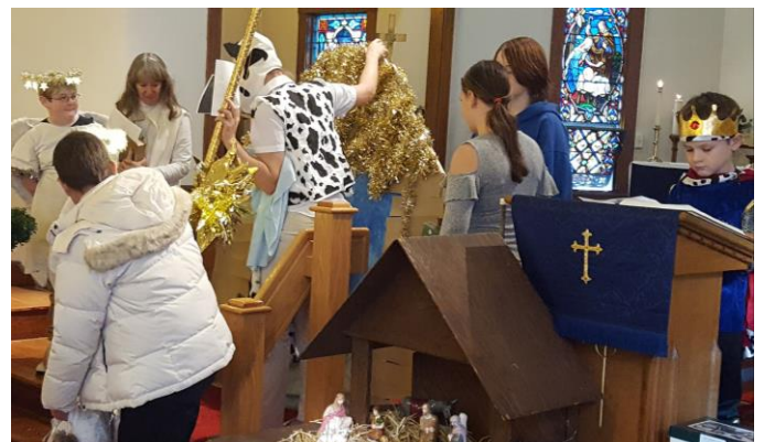
The Pageant wraps up