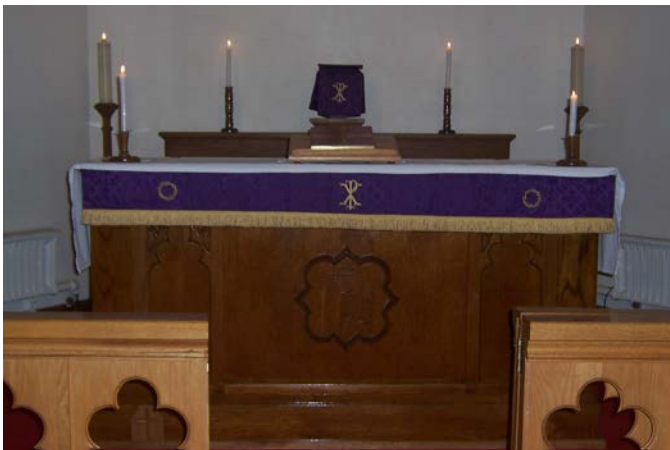
Our Altar during Lent

You will notice no brass candle holders but instead, wooden candle holders. There is no metal chalice or paten during Communion but rather a ceramic chalice and paten are used. No brass Altar Book Stand, but one made of woods. The color for Lent is Purple. There are also no Altar Flowers during Lent.