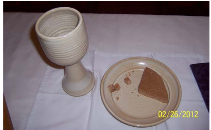
Ceramic Chalice and Paten used during Communion

The same is true with our Liturgy which undergoes a dramatic shift in tone during Lent. At the 7:30 a.m. worship service not to much changes during the service. At 9:30 a.m. we notice more changes. No music for the Gospel Acclamation, no Offertory Anthem and no singing or saying the word "Alleluia".