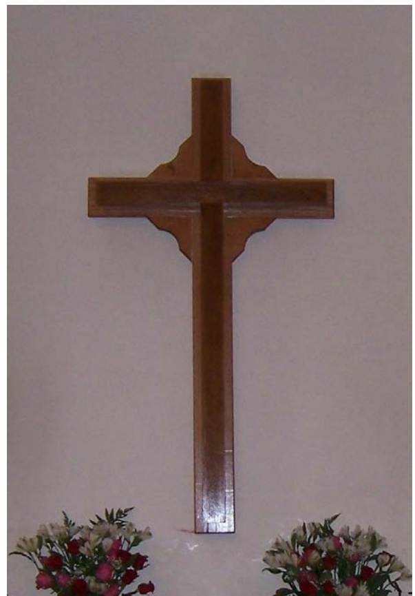
Our refinished cross

Well, the effect really makes the cross "pop" off the wall. Great job Ernie and thanks for sharing your vision.