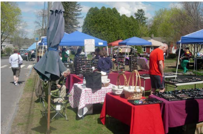
Last year vendors lined Babcock Avenue on the church lawn