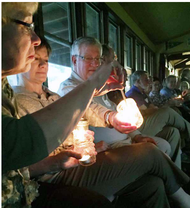
Candles