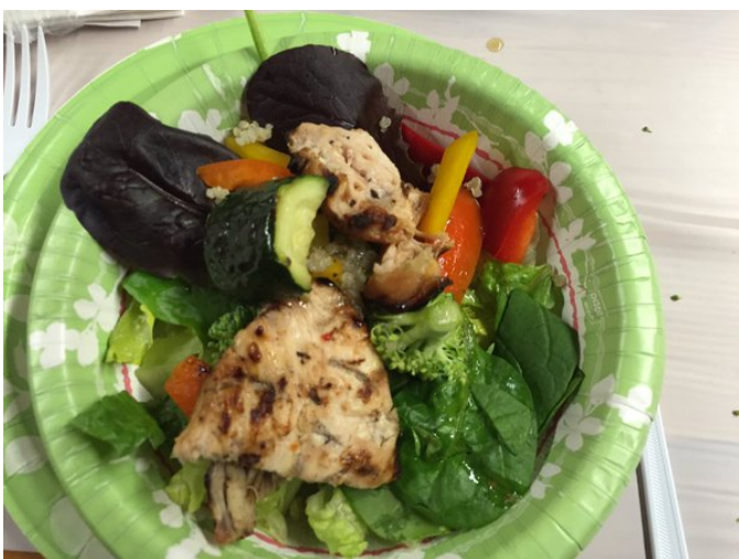
Dinner salad