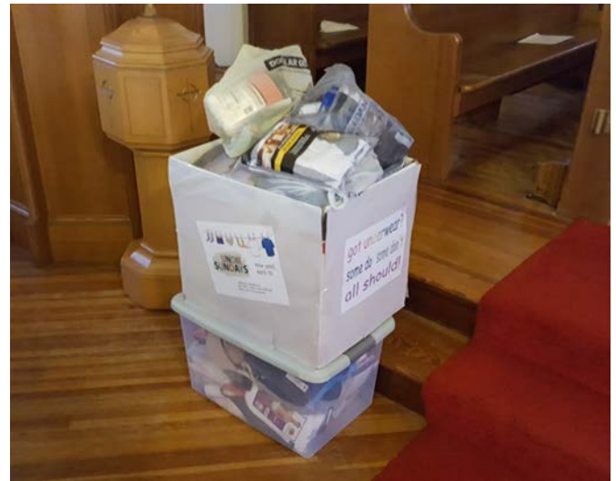
Items collected for the Underwear Drive

Beginning in Lent and running into the Easter season, we collected Underwear to donate to the Homeless Shelter in Danielson. Items included male medium, large and extra large underwear and tee shirts, female underwear all sizes including XXL and sports bras. We are also collected cotton socks. Thanks to all who made this drive so successful!