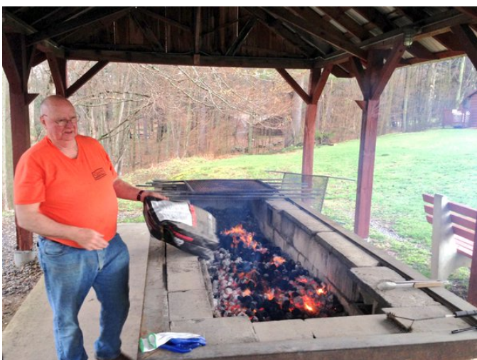
Grilling dinner