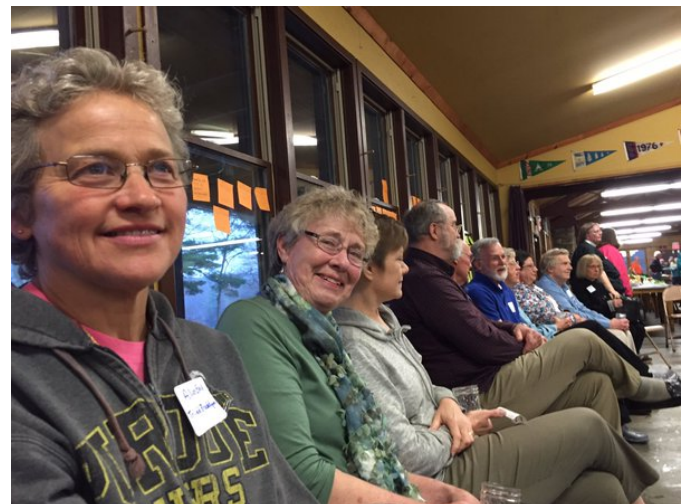
Northeast Region

The Northeast Region of the Episcopal Church in Connecticut (EECT) held its Region Convocation April 22-23, 2016 - the first in the series of six to take place before July 1 - and it was a great success! They met at a Boy Scout camp in Ashford, shared stories of what God was up to, broke bread together (with some making the dinner together, as well), worshipped God, and made decisions. Search for #ecct and #northeast to find more photos, and commentary, on social media. Photos below are from social media posts.