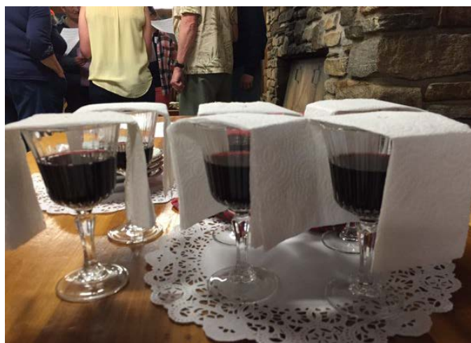
Eucharist prep