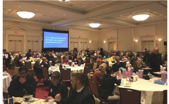
Convention, Friday, Oct. 26.