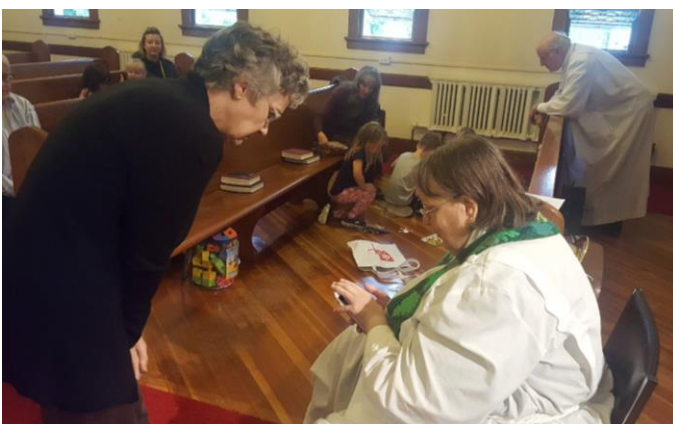
A picture of Anne Ouillette's cat Autumn receives a blessing