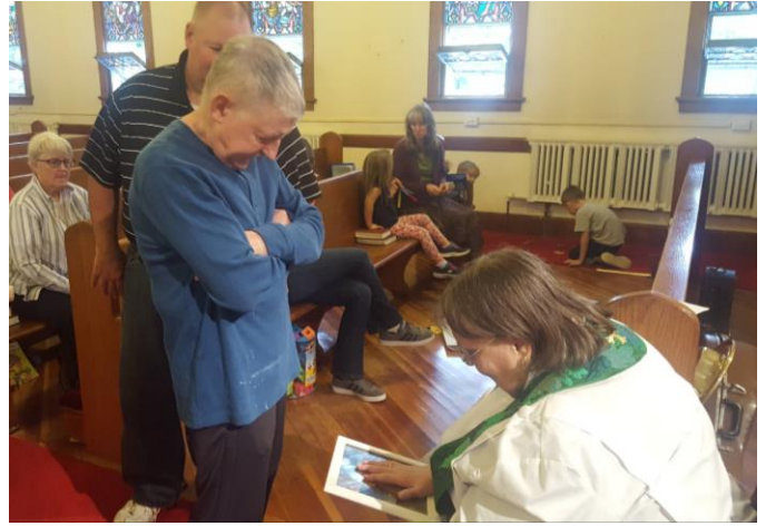
A picture of Phil's dogs receives a blessing

Prayers were offered to pictures for those pets that did attend. Prayers were also offered for pets that had passed away.