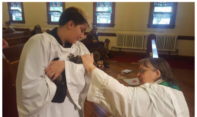
Blake's cat is blessed