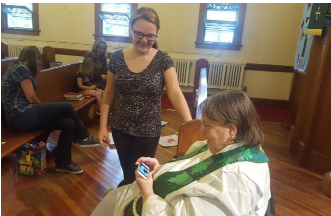
A picture of Leilani's cat receives a blessing