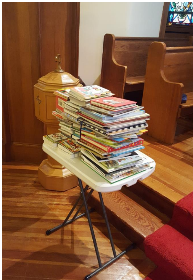
Some of the recently donated books