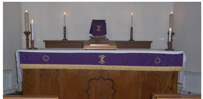
Our Altar during Lent

You will notice no brass candle holders but instead, wooden candle holders. The collection plate is either a woven basket or wood not the brass that we use during the rest of the season. Our processional cross made of wood and brass is just plain wood. The color for Lent is Purple. There are also no Altar Flowers during Lent. This is all done intentionally to reflect a more solemn, prayerful and reflective mood as we wait in anticipation of the glory of Easter.