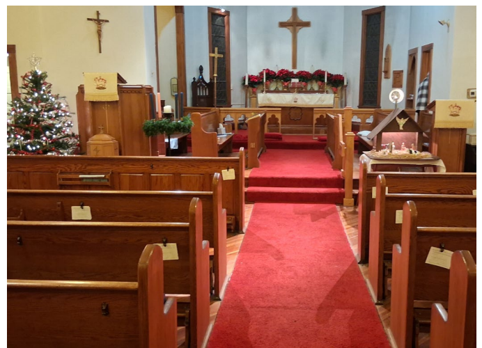
Our Sanctuary during the Christmas season