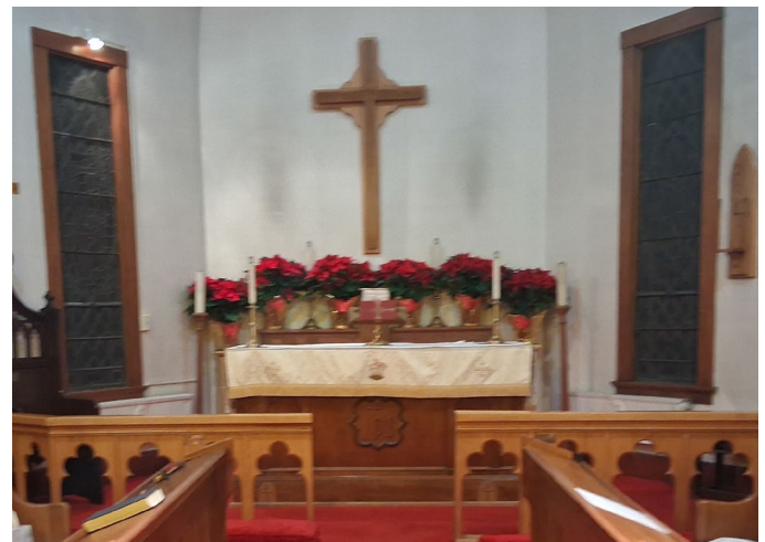
Our Altar during the Christmas season